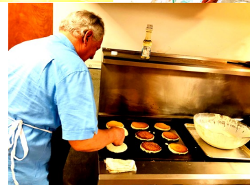
Thank you all for helping out and attending the Pancake Breakfast!