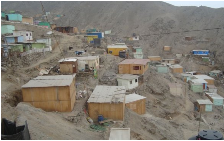
New migrant homes