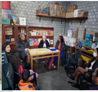
July meeting with migrant families