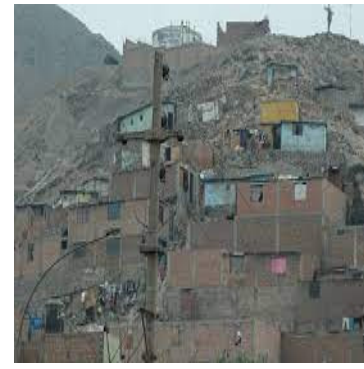
Children's homes near the church