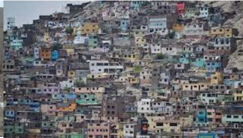
San Cristobal Hill in San Juan de Lurigancho district (congregation is at the foot of the hill)